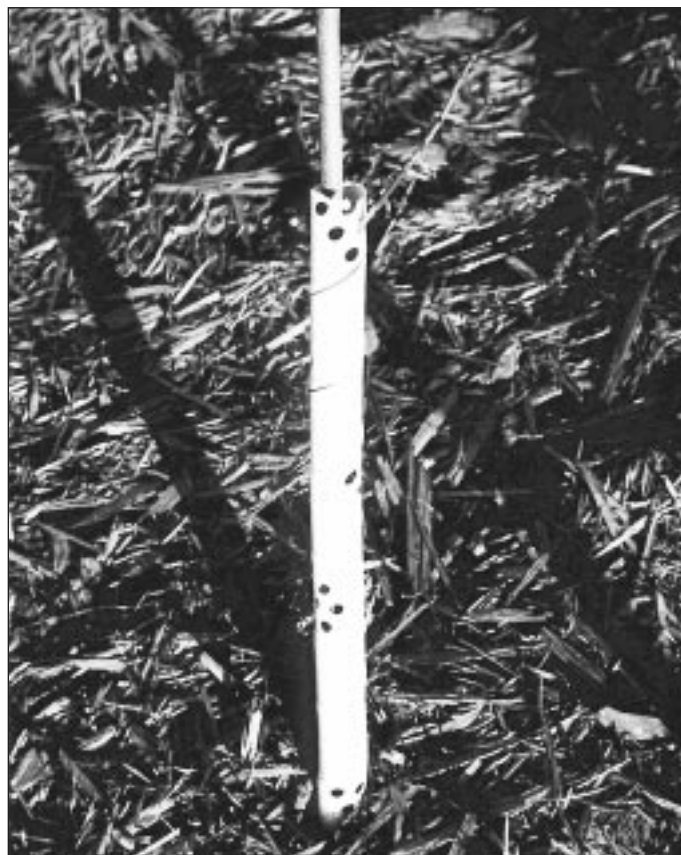
Spiral Guards expand as saplings grow.