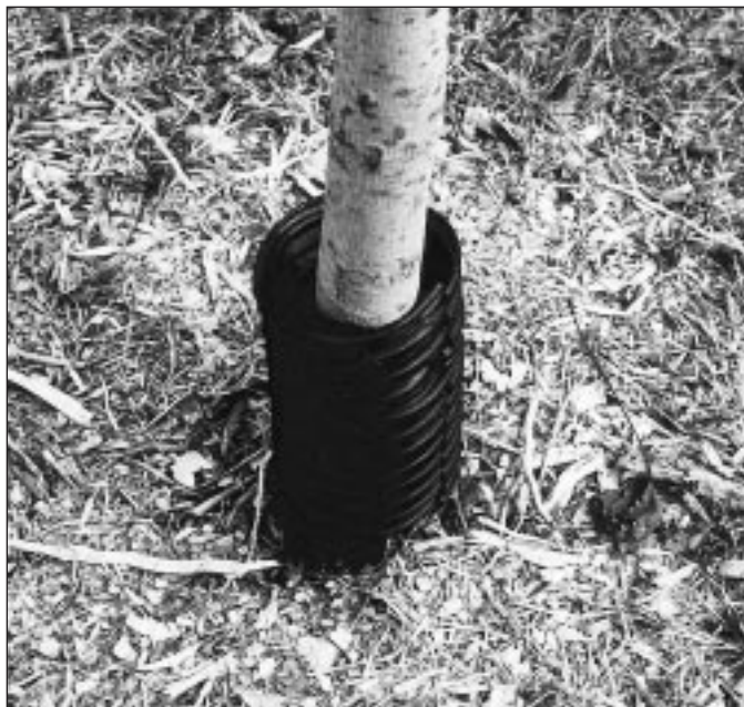
Field tile protects trees from weather, small mammals and equipment. White field tiles are preferable to black.

Note: The mention of trade names of products is for the convenience of the reader and does not constitute endorsement of a particular product by the Ministry of Natural Resources to the exclusion of any other suitable product.