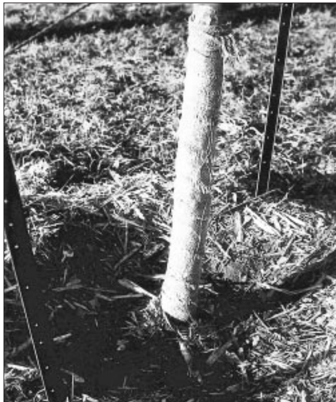
Loosely wrapped and secured with rope, burlap protects trees from extreme temperatures.

Hardware cloth protects trees from animals and equipment, but it doesn't protect them from weather. Place the hardware cloth around the tree, but not touching it. The bottom of the wire should extend five