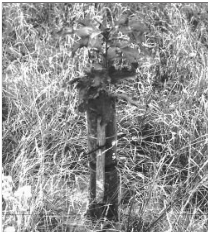
A stack of four plastic pop-bottles protects saplings from weather, small mammals and equipment.