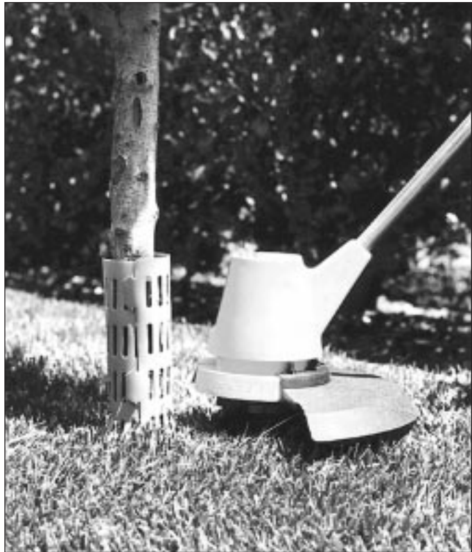
ArborGards expand as trees grow and have ventilation holes that prevent moisture buildup.

Spiral Guards are plastic strips that can be wrapped around tree trunks. They protect trees from weather damage, and animal browsing. Ventilation holes allow the trunk to