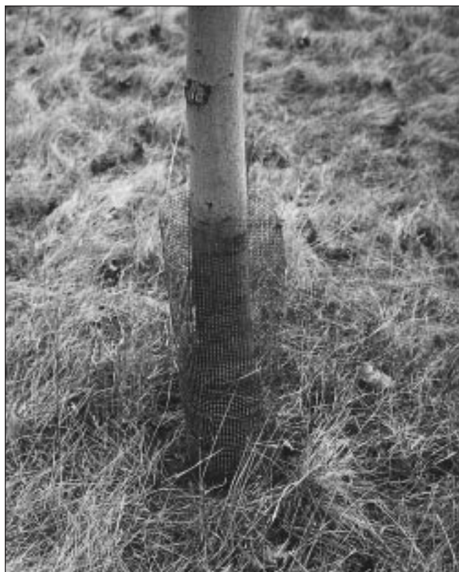
Hardware cloth protects trees from voles and other small mammals.