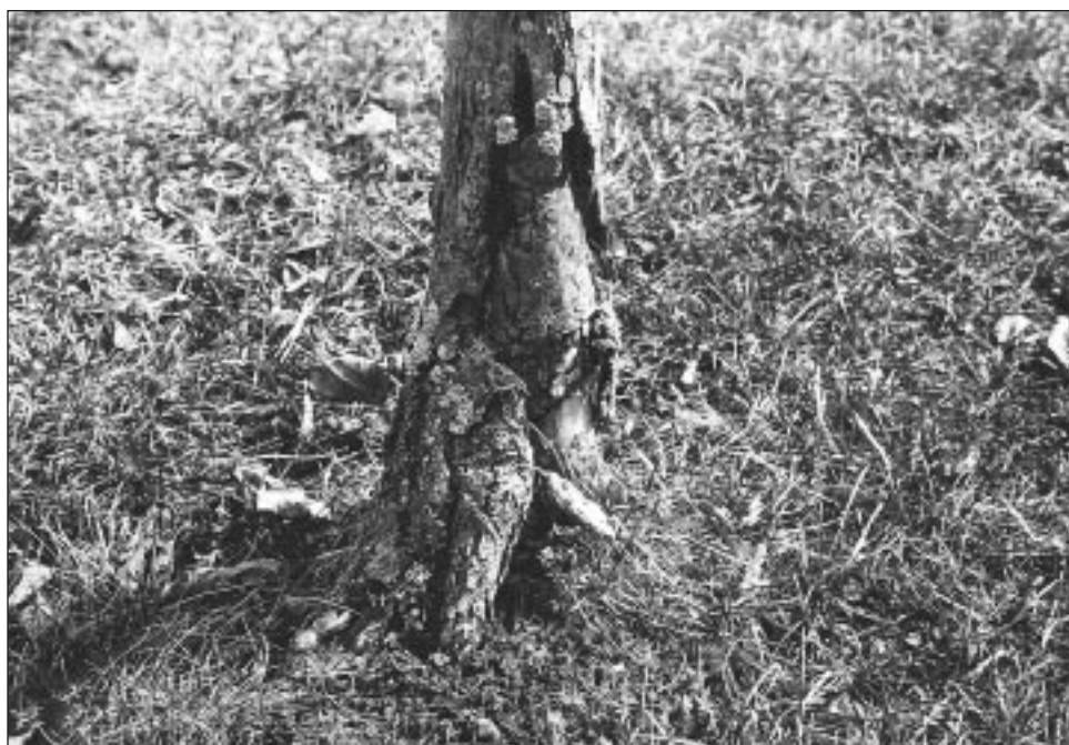
Grass trimmers and lawn mowers can damage the bark and cambium of trees.

In the winter, when other foods are scarce, voles, mice and rabbits eat the bark of young trees. Voles, which cause the most damage, frequently girdle a tree by removing a strip of bark from around the tree, usually within 30 centimetres of the ground. Girdling can kill a tree. Some